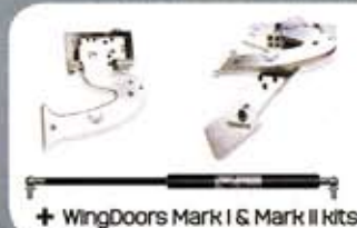
+ WingDoors Mark I & Mark II Kits

these Lambo door kits are available for all cars and models ranging from a Civic to a Ferrari."