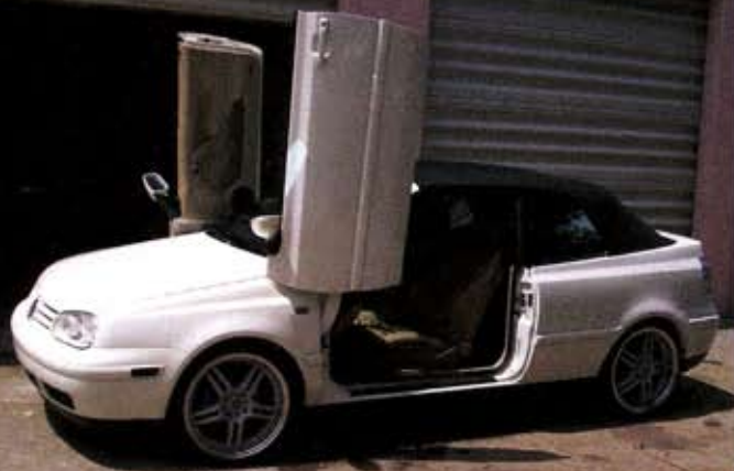
+ WingDoors Volkswagen Cabrio